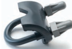
Right Angle Beam Clamp