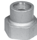
Bell Reducing Coupling