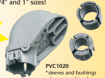
PVC1020 *sleeves and bushings shown combined

PVC1040 fits 1-1/4" and 1-1/2" PVC, rigid and EMT.