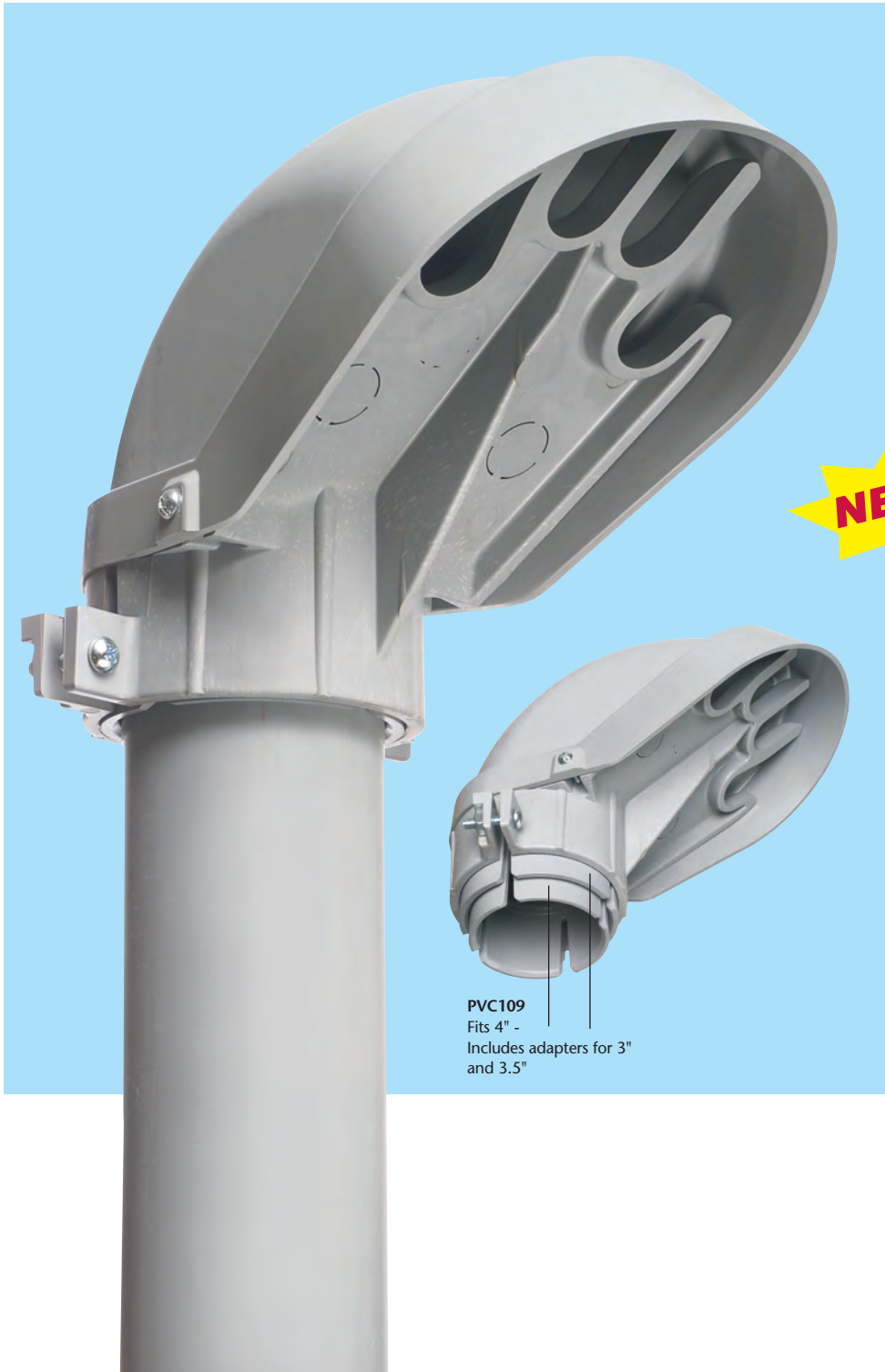
PVC109 Fits 4" - Includes adapters for 3" and 3.5"

Made of UV rated plastic for long outdoor life, Arlington's entrance caps come with adapters that fit a range of sizes, so you'll have fewer products to stock .