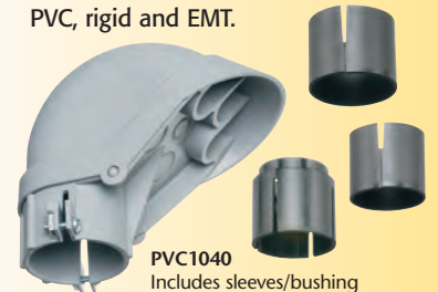
PVC1040 Includes sleeves/bushing for 1-1/4 and 1-1/2

PVC1040 fits 1-1/4" and 1-1/2" PVC, rigid and EMT.