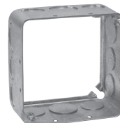
TP443 (2 1/8" Deep)