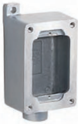
SWB-1, 2, 3