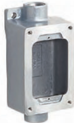
SWB-4, 5, 6