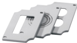
Single gang inserts