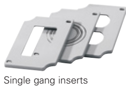
Single gang inserts