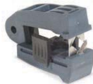
"V" Blade Cassette