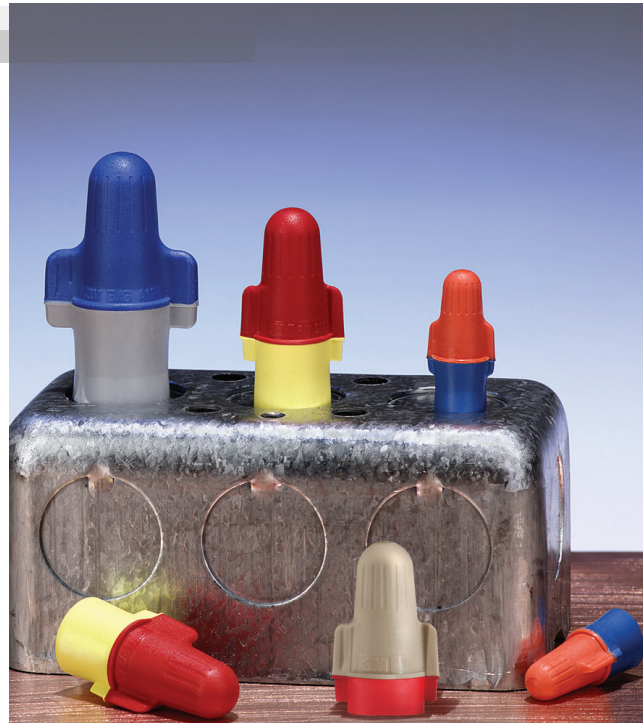
3M™ Performance Plus Wire Connectors