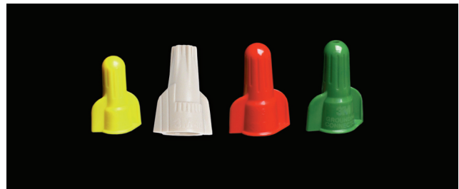
3M™ Electrical Spring and Grounding Connectors

The quick-spin, wing-torque design of Electrical Spring and Grounding Connectors 312, 412 and 512 is easy on your fingers. The day's last connection will feel almost as good as the first. Generous expansion room accommodates a wide range of solid or stranded wire. Use the 312 (yellow) connector for wire combinations from 3 #20 to 3 #12 AWG, the 412 (tan) connector for 2 #20 to 3 #10 AWG and the 512 (red) connector for 2 #18 to 5 #12 AWG. The 512G (green) is used for grounding connections.